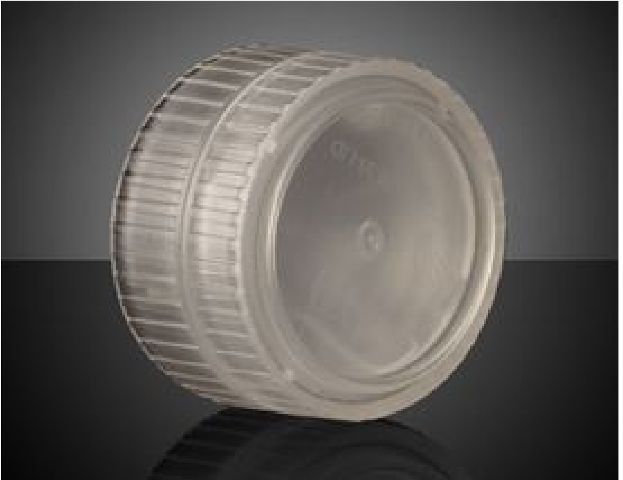
Non-Contact Impact Case for 19.1 Dia. x 6.35mm Thick Optics