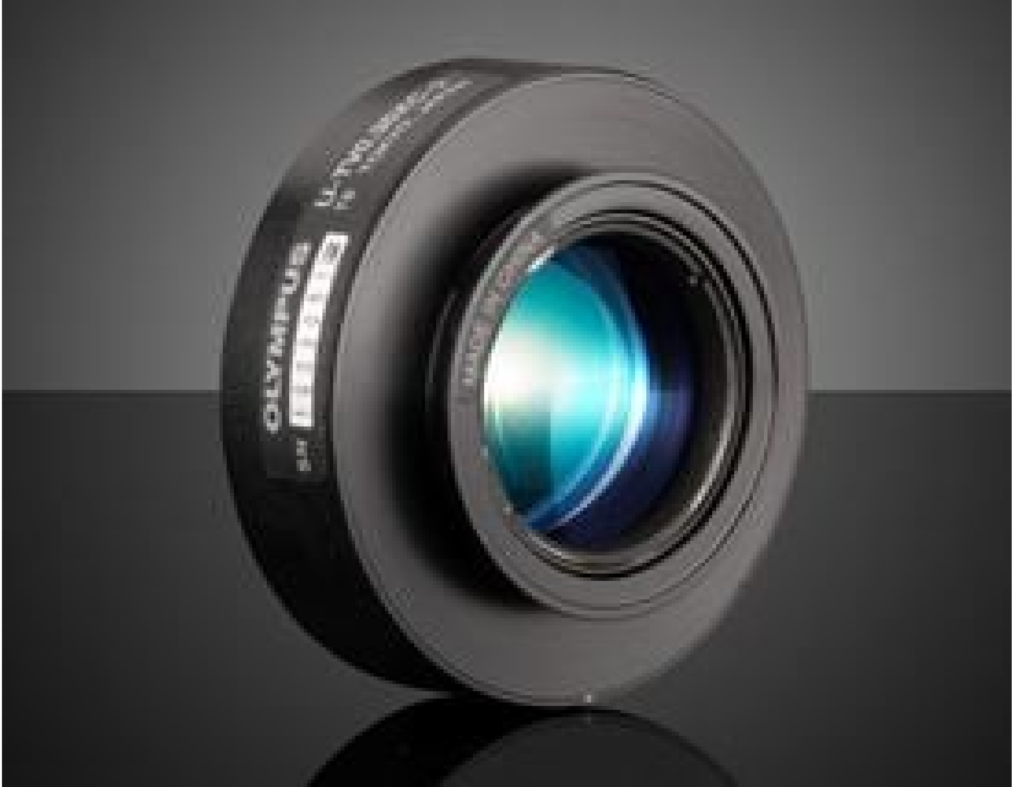
#23-724: Olympus C-Mount 0.35X Camera Adapter