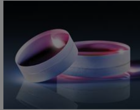
#32-724 - 25mm Dia. x 60mm FL, MgF 2 Coated, Achromatic Doublet Lens €122,00