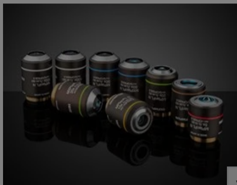
Olympus M Plan Fluorite Semi A Achromat Infinity Corrected Objective

Please select your shipping country to view the most accurate inventory information, and to determine the correct Edmund Optics sales office for your order.