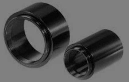
C, S, and T-Mount Extensions Tubes