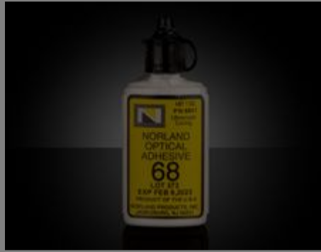
#36-427 - Norland Optical Adhesive NOA 68, 1 oz. Application Bottle €41,50