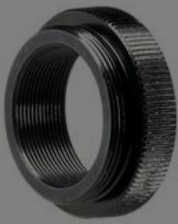
#03-627 - C-Mount Male to Olympus (RMS/DIN) Female Step-Down Adapter €52,00