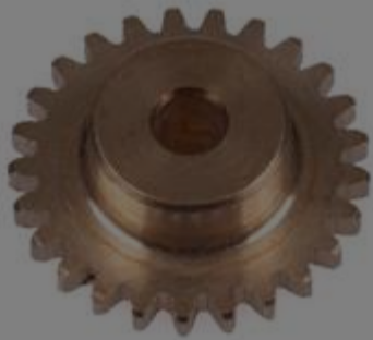
#34-517 - 10.8mm Motorizable Iris Spur Gear €11,50