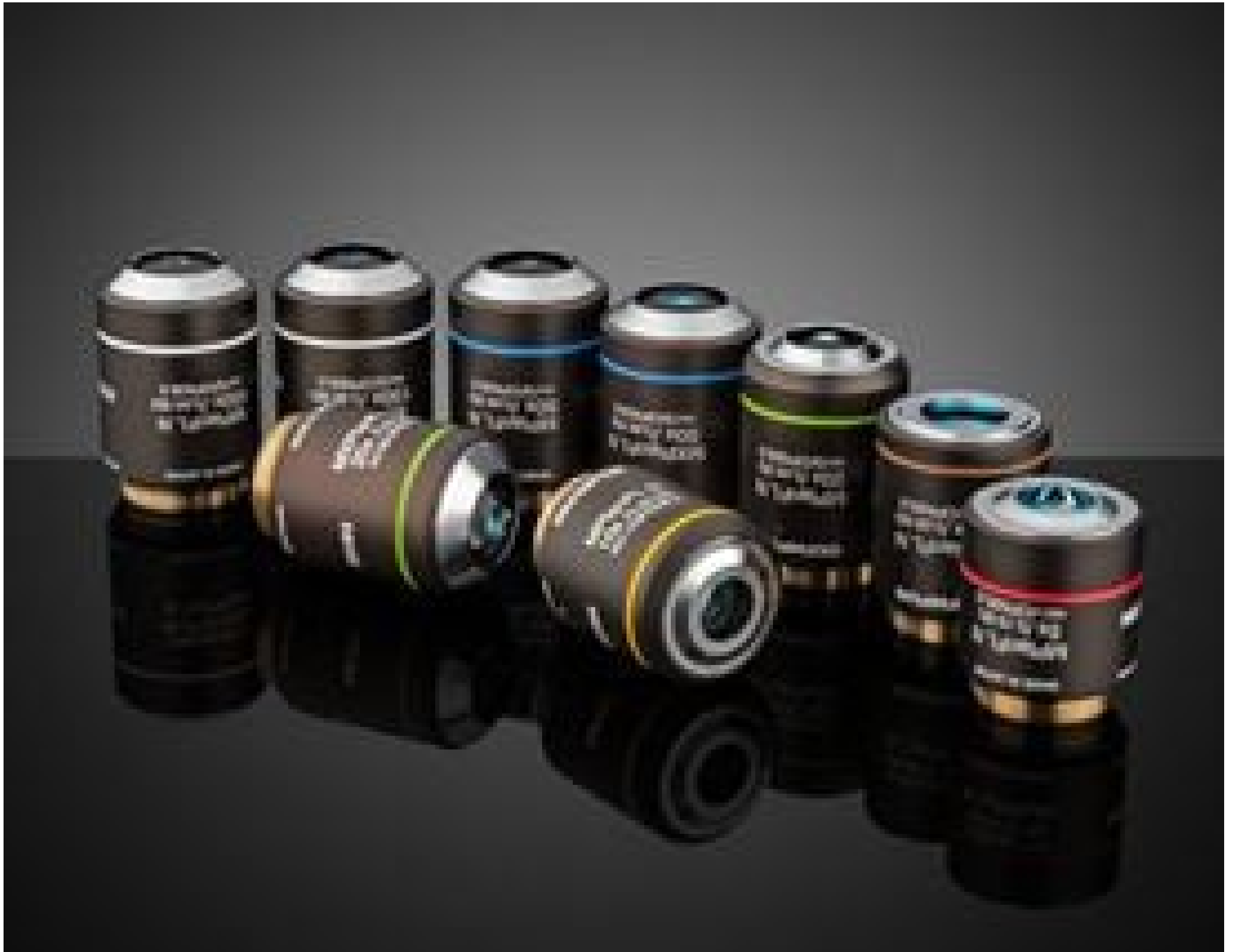
Olympus MPlan Fluorite Semi Apochromat Infinity Corrected Objectives