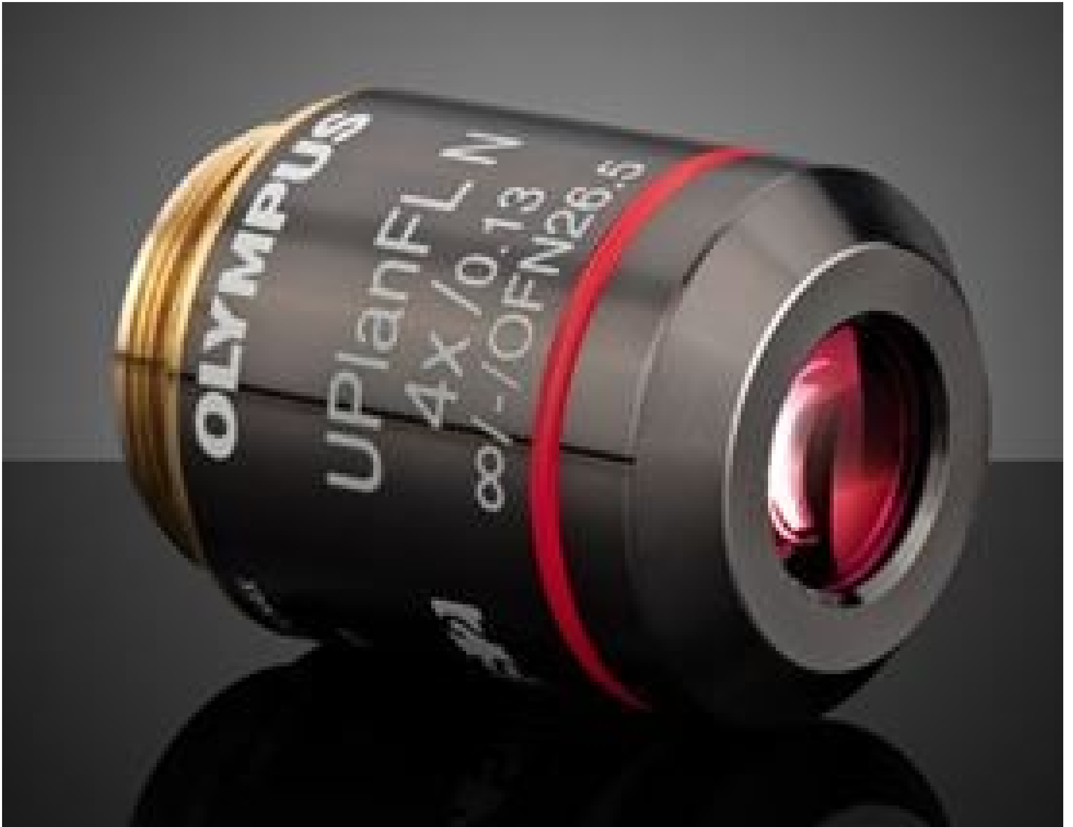
Olympus UPLFLN 4X Objective