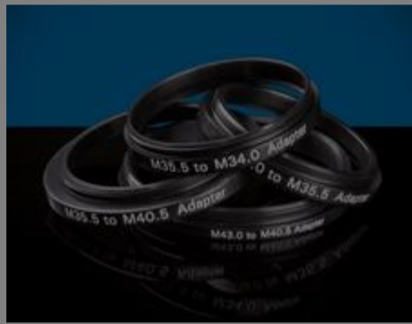
Machine Vision Filter Adapters