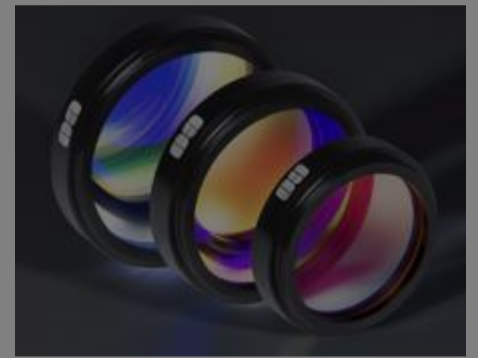
High Performance Mounted Machine Vision Filters