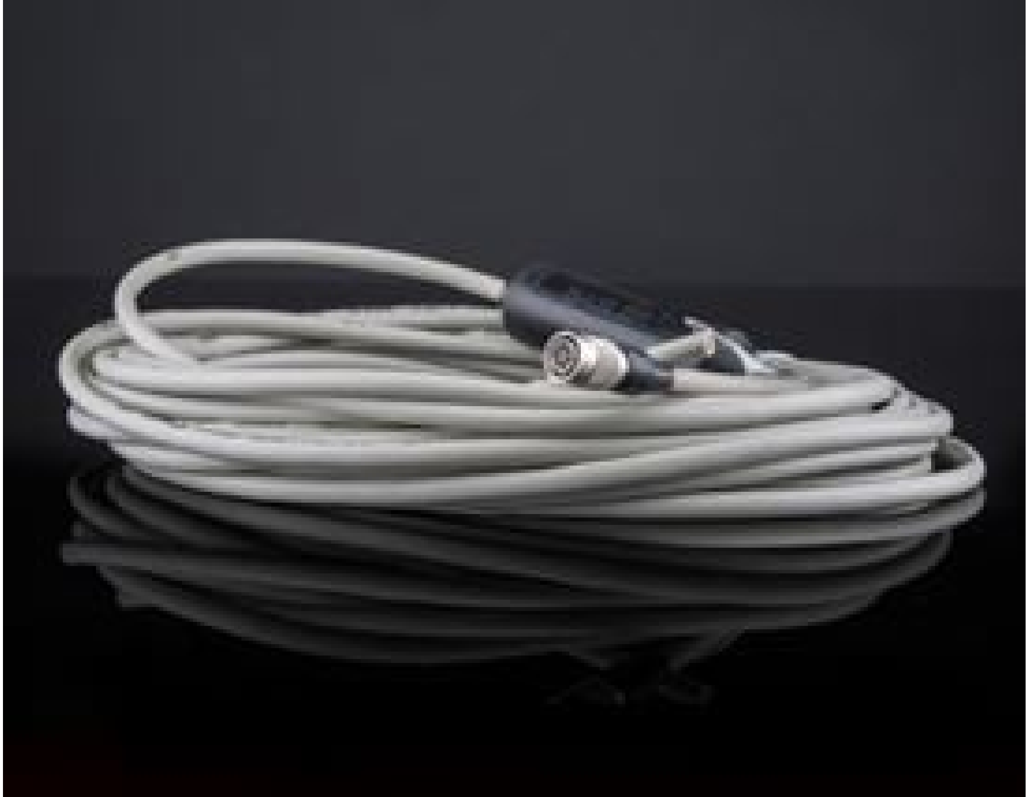
PLC (Programmable Logic Controller) I/O Cable Hirose 6 Pin 10m, #68-467