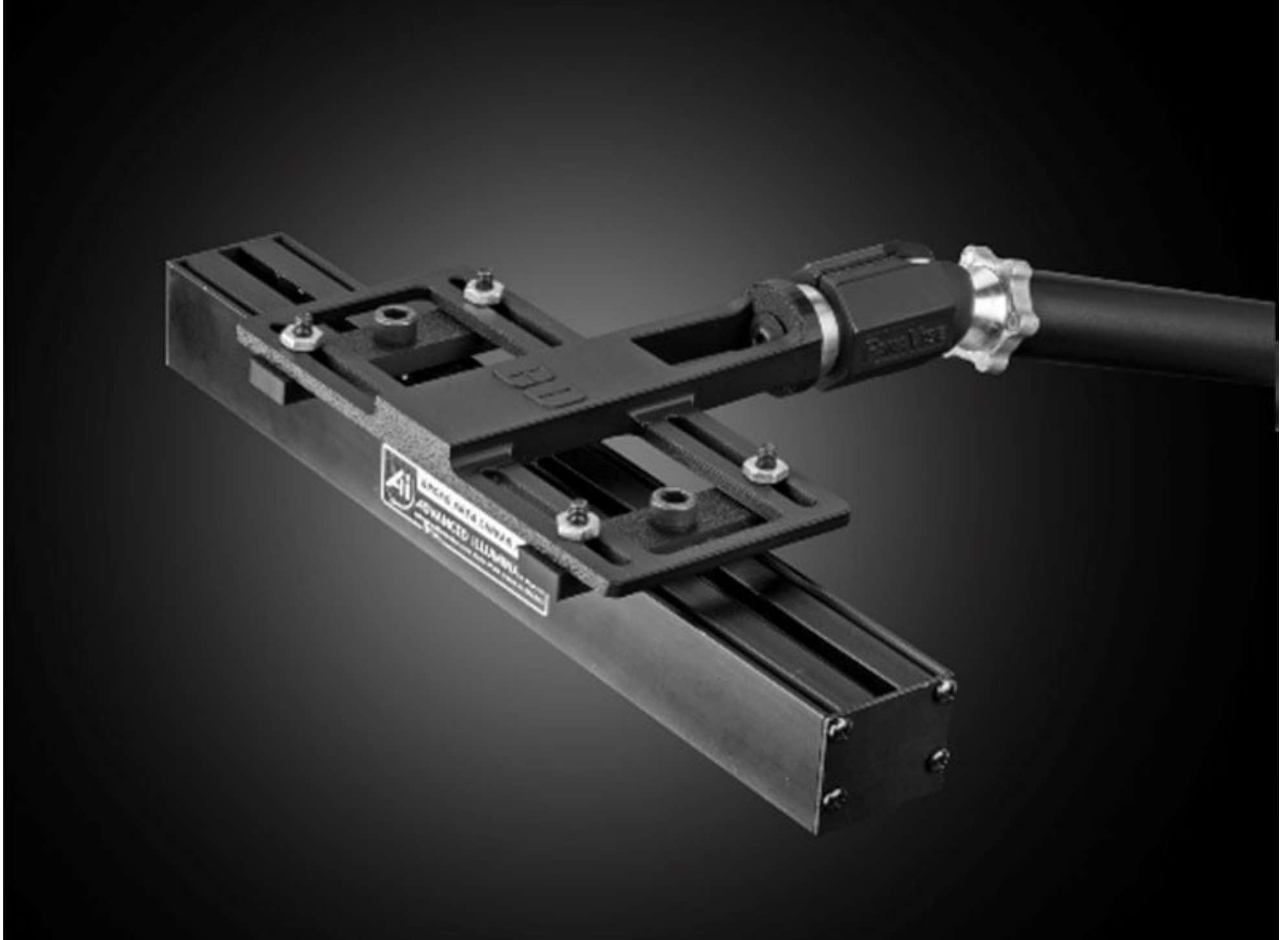
Bar or Line Light Configuration