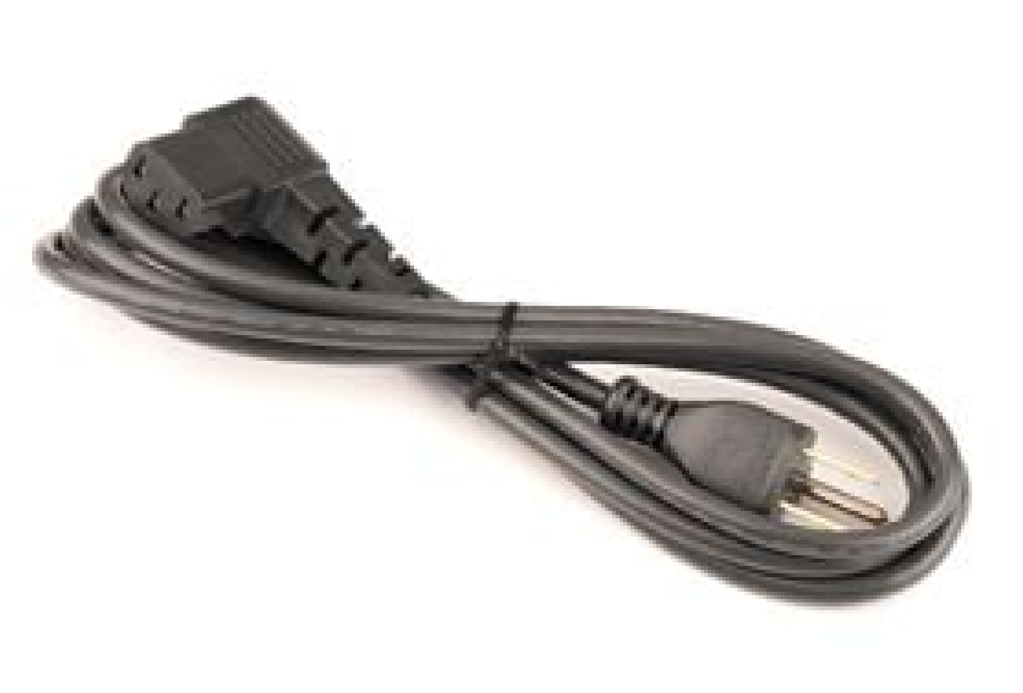
Power Cord for CX43 Microscope (USA) | Olympus UYCP-11