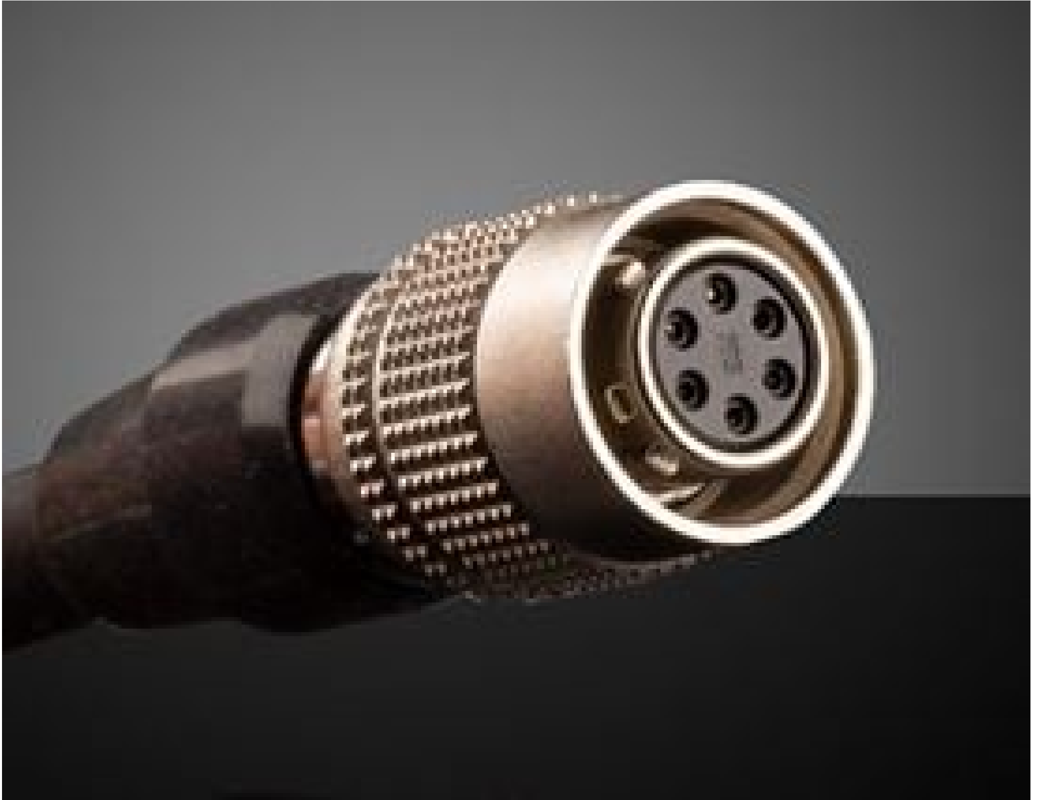
Power Supply 12VDC / Hirose 6 Pin, #68-466