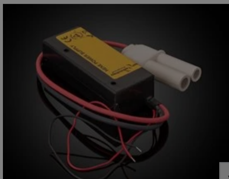
DC with Bare Leads HeNe Laser Power Supply

Please select your shipping country to view the most accurate inventory information, and to determine the correct Edmund Optics sales office for your order.