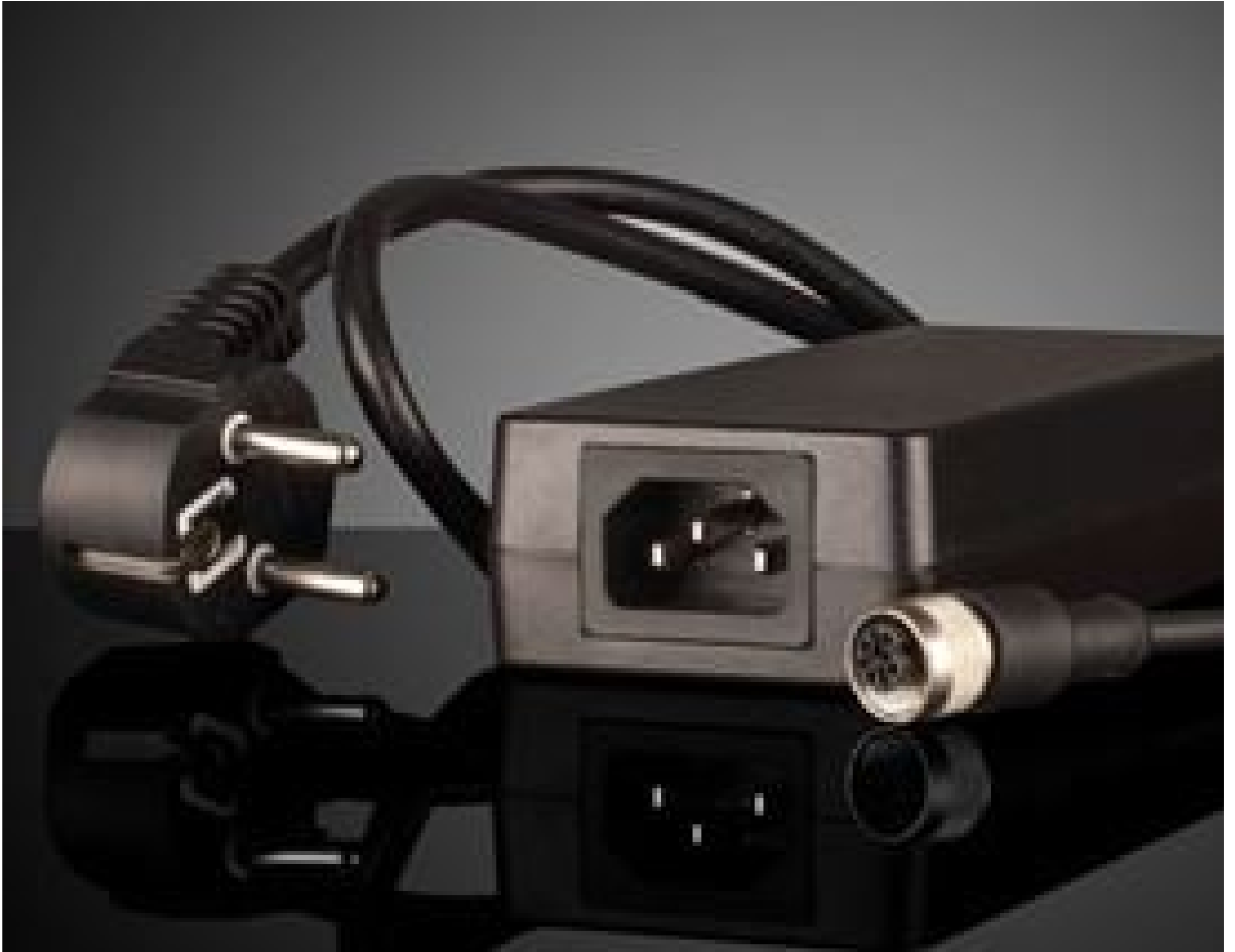
Power Supply for Effilux LED Lights, EU Adapter