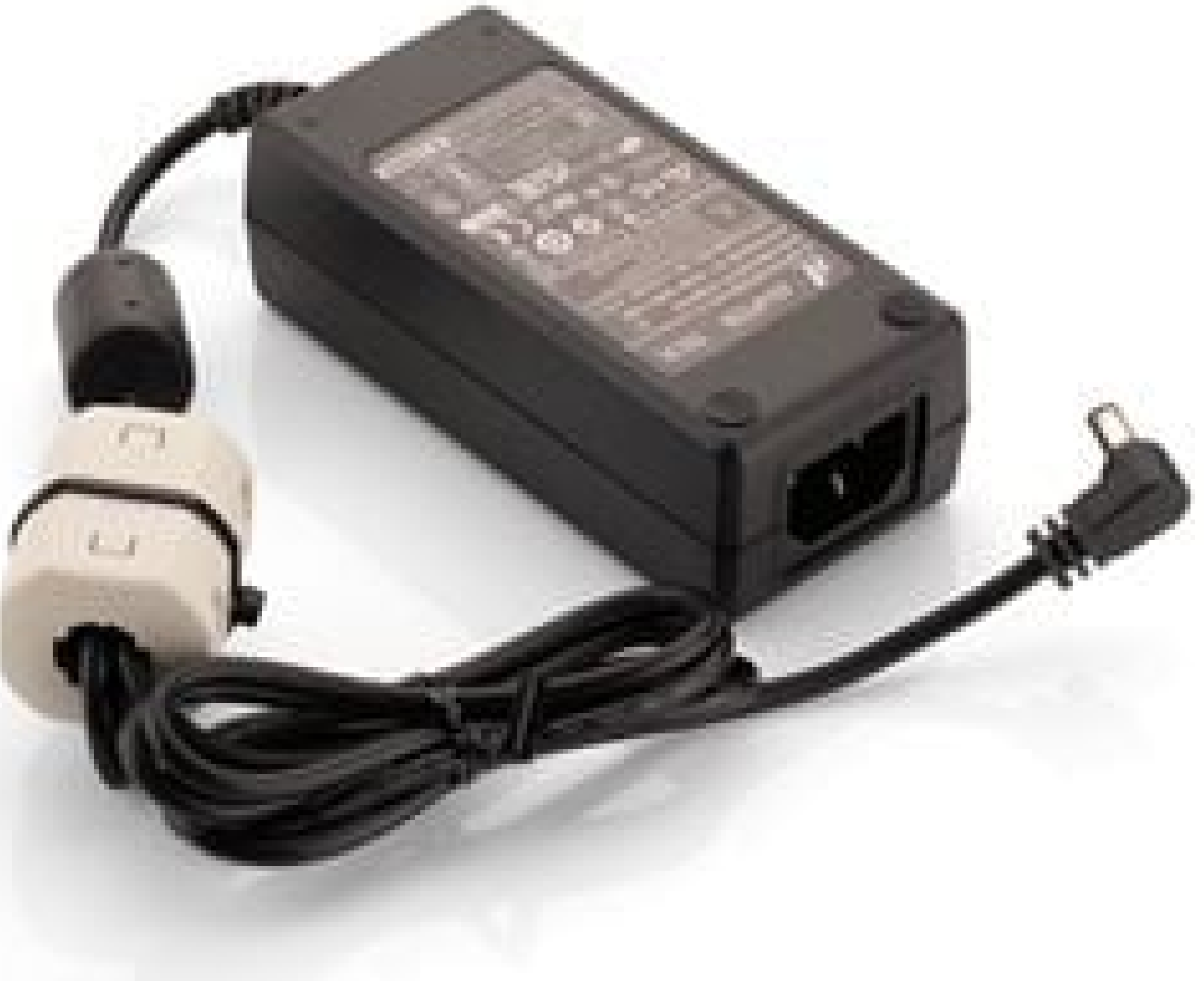
Power Supply for MFC-200