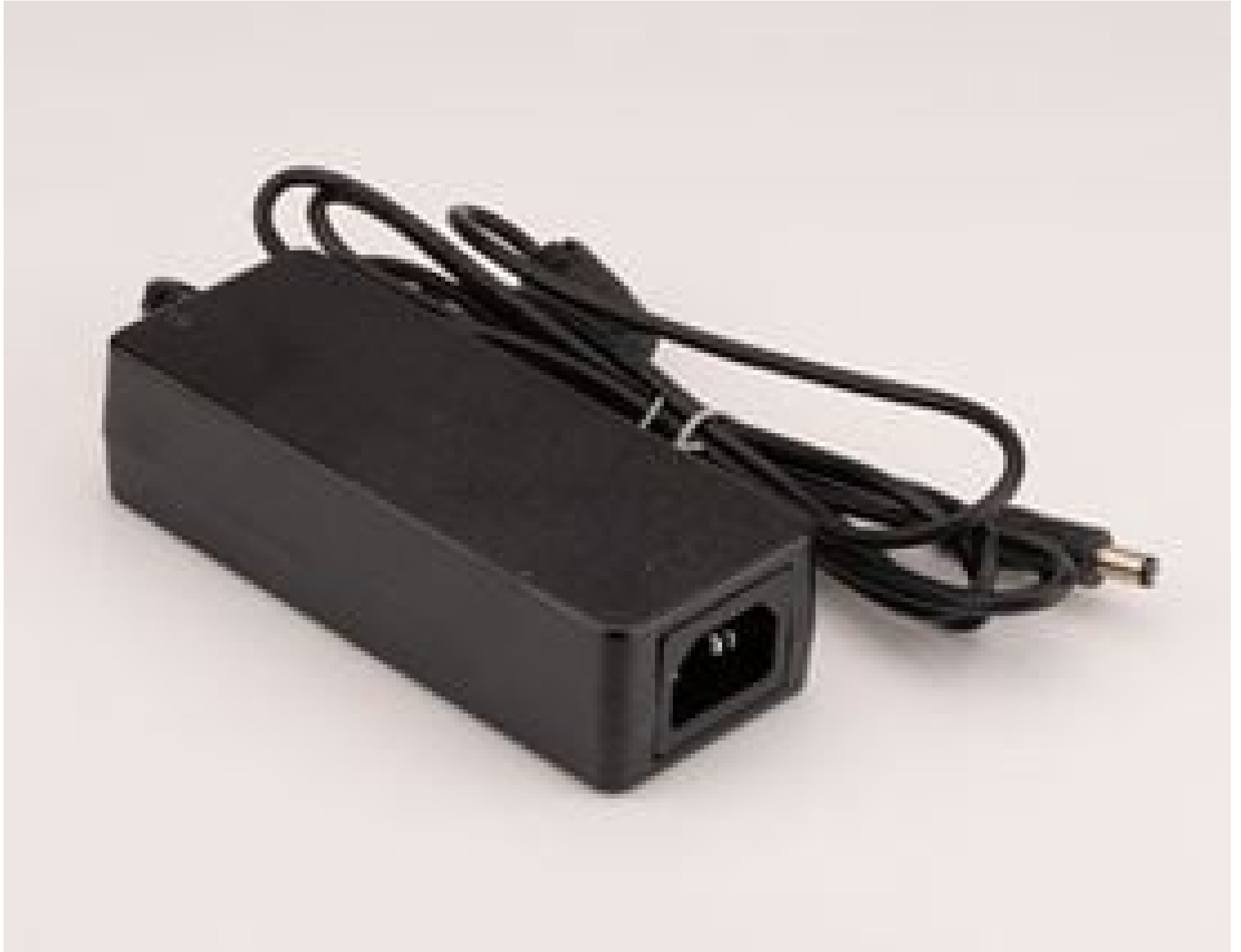
#16-791: Power Supply for SCHOTT VisiLED Ringlights