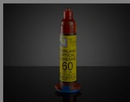
#55-086 - Preloaded Norland Optical Adhesive NOA 63 Dispensing Barrel (10cc) €34,00