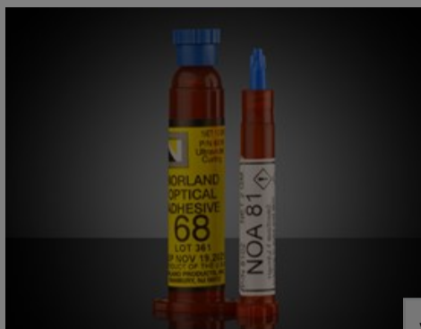
Preloaded Norland Optical Adhesive Syringes