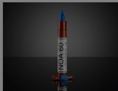
#12-858 - Preloaded Norland Optical Adhesive NOA 160 Dispensing Barrel (3cc) €27,50