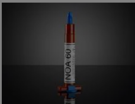
#55-157 - Preloaded Norland Optical Adhesive NOA 65 Dispensing Barrel (3cc) €27,50