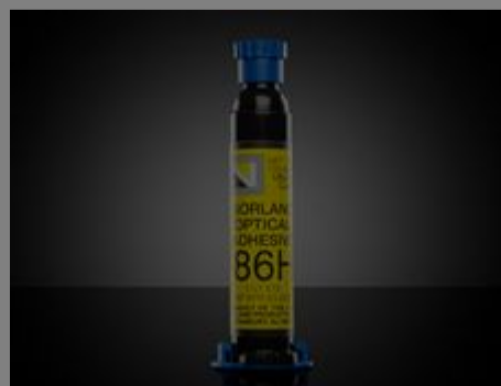
#12-847 - Preloaded Norland Optical Adhesive NOA 86H Dispensing Barrel (10cc) €34,00