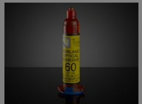
#12-865 - Preloaded Norland Optical Adhesive NOA 146H Dispensing Barrel (10cc) €34,00