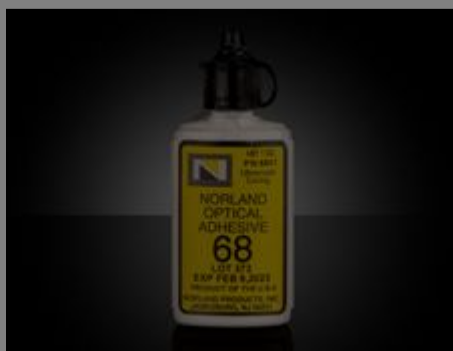
#36-427 - Norland Optical Adhesive NOA 68, 1 oz. Application Bottle €41,50