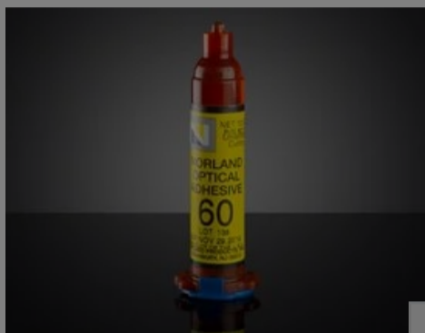
10cc Dispensing Barrel for NOA (NOA 60 shown as an example)