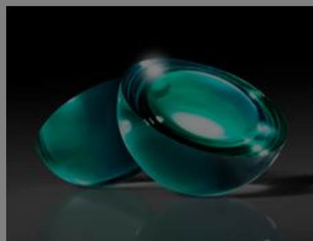
#45-935 - 6.0mm Diameter, N-BK7 Half-Ball Lens €57,50