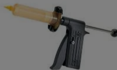
Dispensing Guns and Hand Plungers