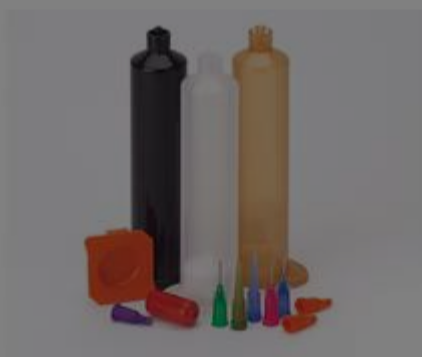
Dispenser Barrels and Accessories