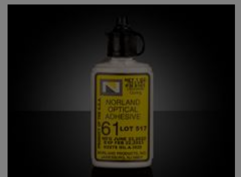
#37-322 - Norland Optical Adhesive NOA 61, 1 oz. Application Bottle €41,50