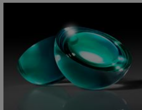
#45-936 - 8.0mm Diameter, N-BK7 Half-Ball Lens €63,00