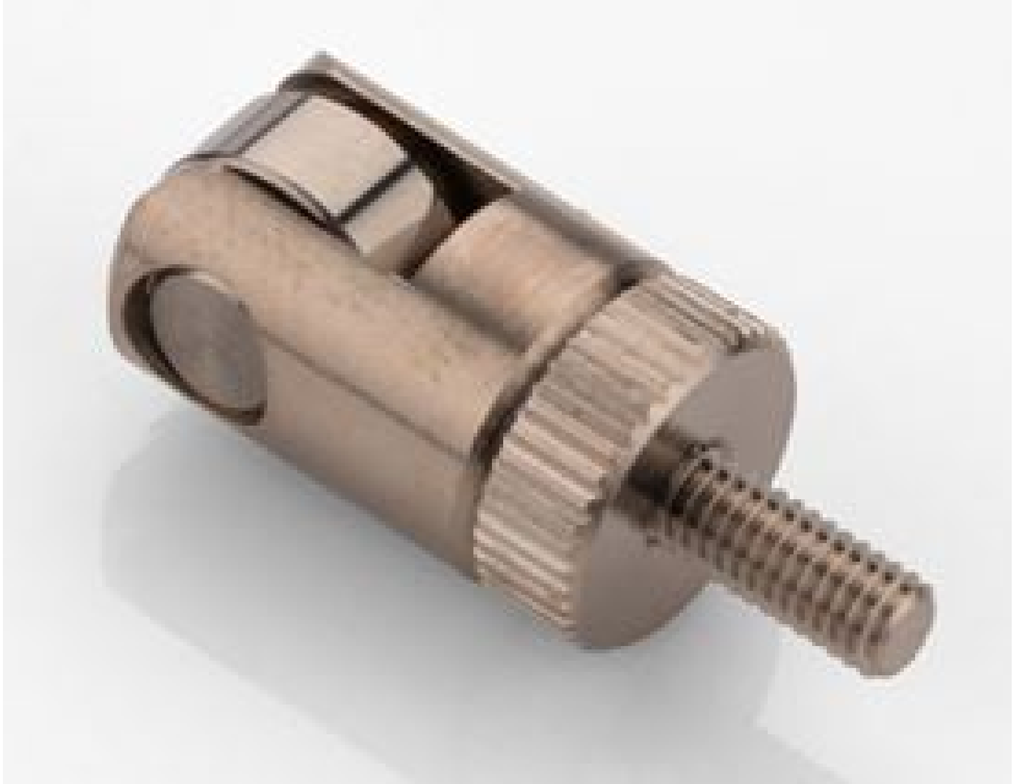
Roller Attachment Measuring Probe