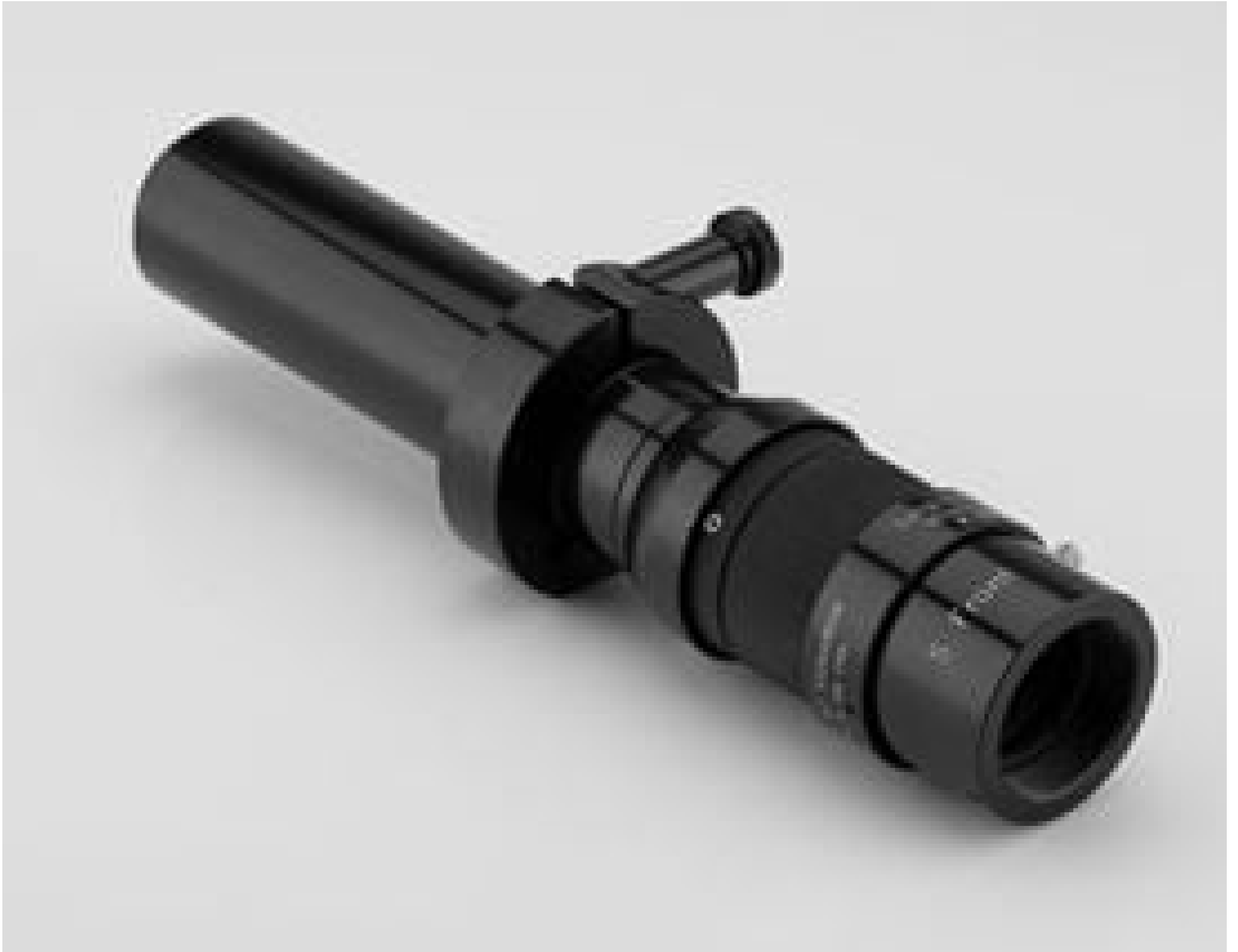
#86-889: S Main Body, C-Mount, KC VideoMax