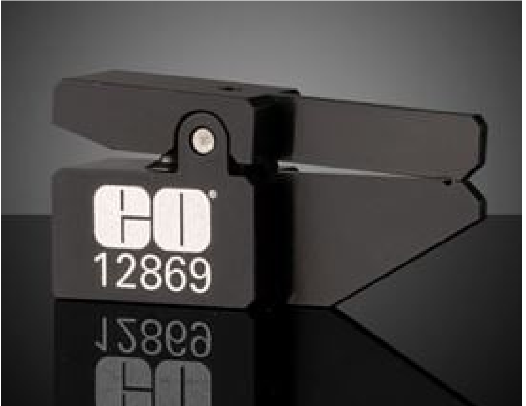
Small Lens Clamp for 1-3mm Dia. Optics, #12-869