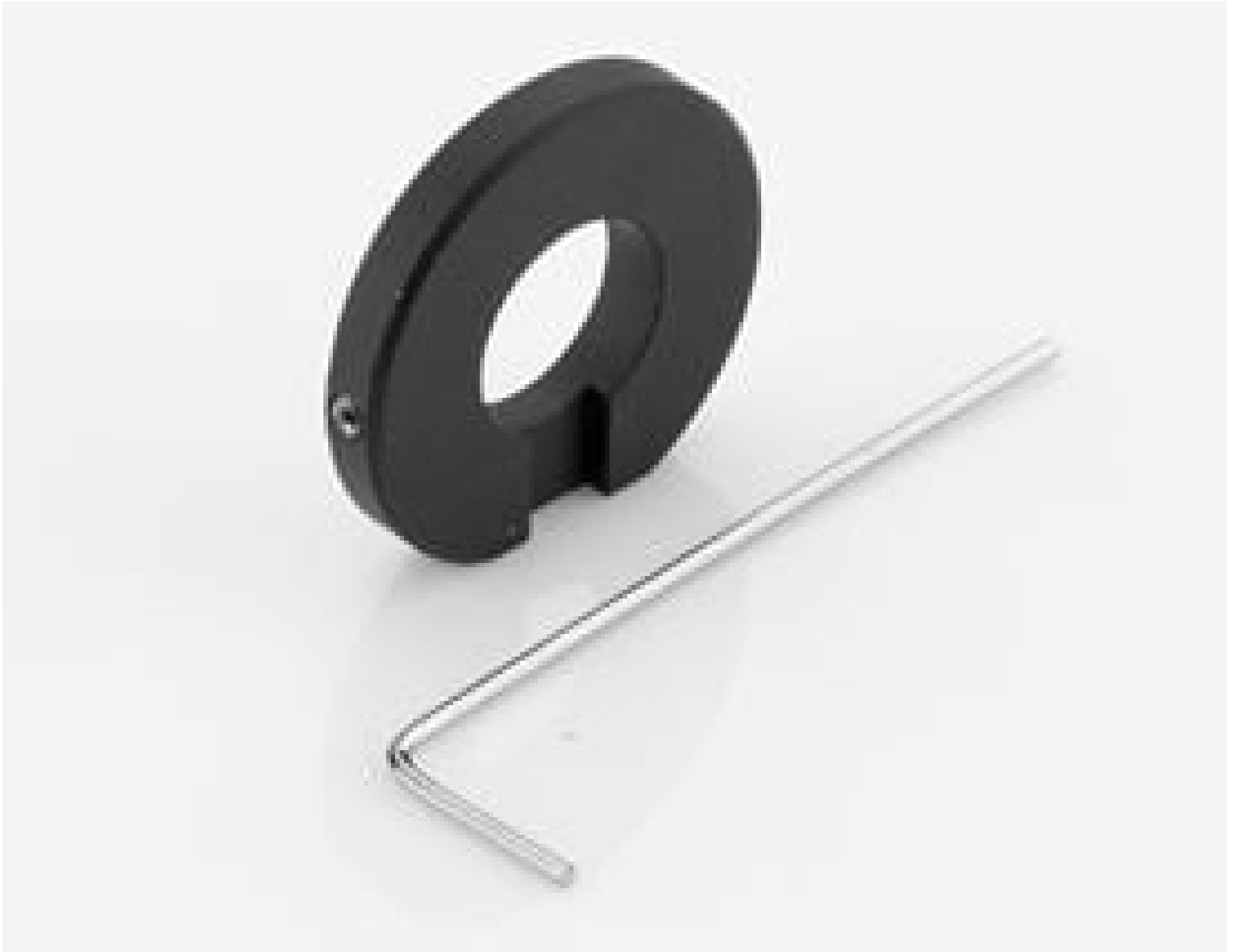
#33-675: Small Liquid Lens Holder for 35mm Cx Lens