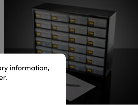
Lab Storage Kit

Please select your shipping country to view the most accurate inventory information, and to determine the correct Edmund Optics sales office for your order.