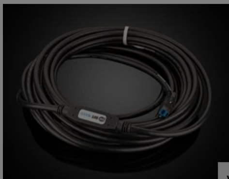
USB3 Type A, w/Thumbscrews to Type-E Straight w/Thumbscrews Cable, 20m

Please select your shipping country to view the most accurate inventory information, and to determine the correct Edmund Optics sales office for your order.